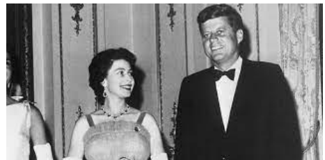
John F Kennedy with our late Queen in 1961

"United there is little we cannot do in a host of cooperative ventures. Divided there is little we can do—for we dare not meet a powerful challenge at odds and split asunder."