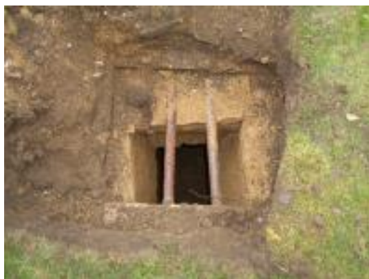
Tunnel Entrance or Vent

Aynho History Society was established in September 2007 and now has nearly seventy members. We have continued to research and present a range of local history subjects including Artefacts Found In and Around Aynho, Extracts from The Cartwright Papers, Lark Rise to Candleford, England's Canals and The History of Middleton Cheney Church with its wonderful Burne-Jones and William Morris artworks. All presentations are enhanced with digital photographs and a PA system for ease of listening. Many of our presentations are personally researched and presented by members with guest speakers.