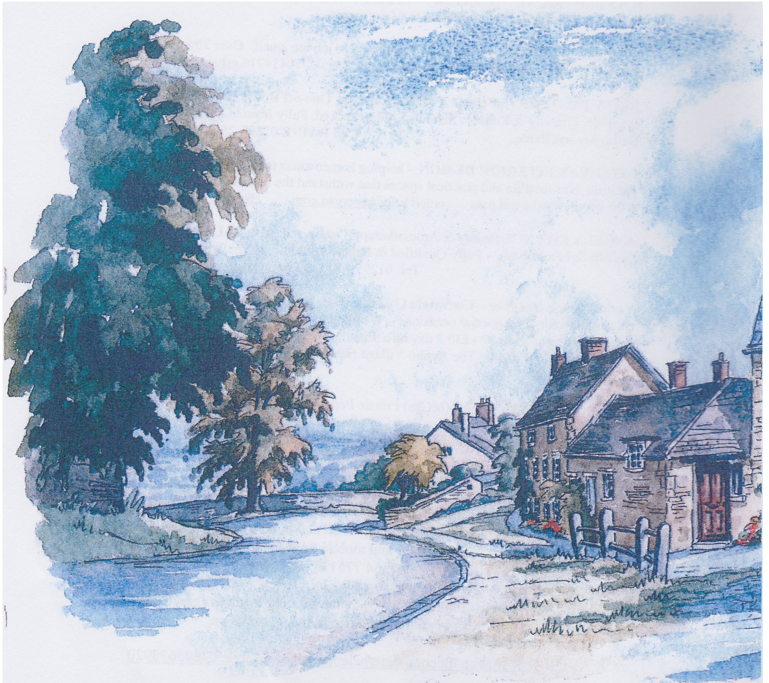
SUSAN WOOLLEY 1989