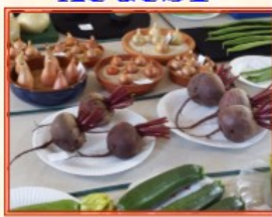
FRUIT & VEG SHOW