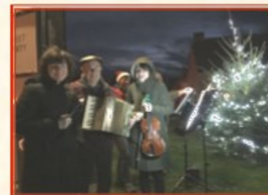
CAROLS ON GREEN