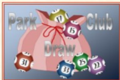
PARK CLUB DRAW