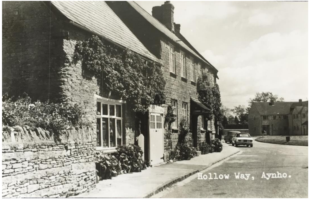
View of old Aynho Tea Rooms