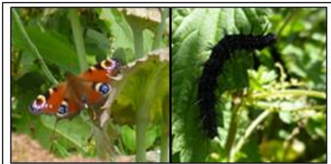
Peacock Butterfly Adult and Larvae

From the Spring of 2014 we have been surveying the playing field recording its flora and fauna and looking at ways in which we can encourage biodiversity here and enhance the habitat on the 2 mounds. Over the