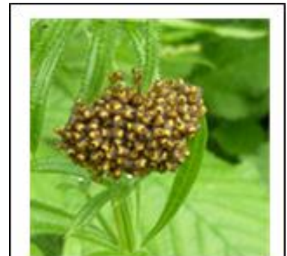
Cross Orbweaver Spider Cocoon

Although to some the nettles on the mounds look a mess they are an essential food source and habitat