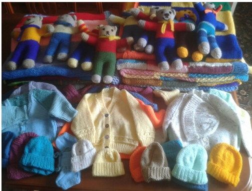
Teddies/Blankets/Matinee Coats etc