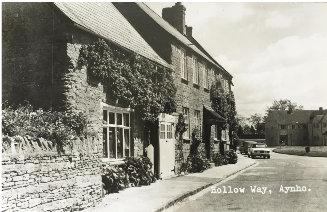
View of old Aynho Tea Rooms