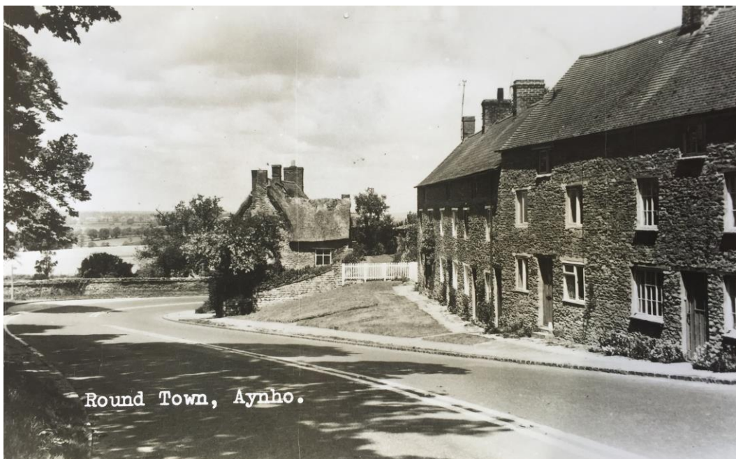
View of Roundtown & over Cherwell Valley