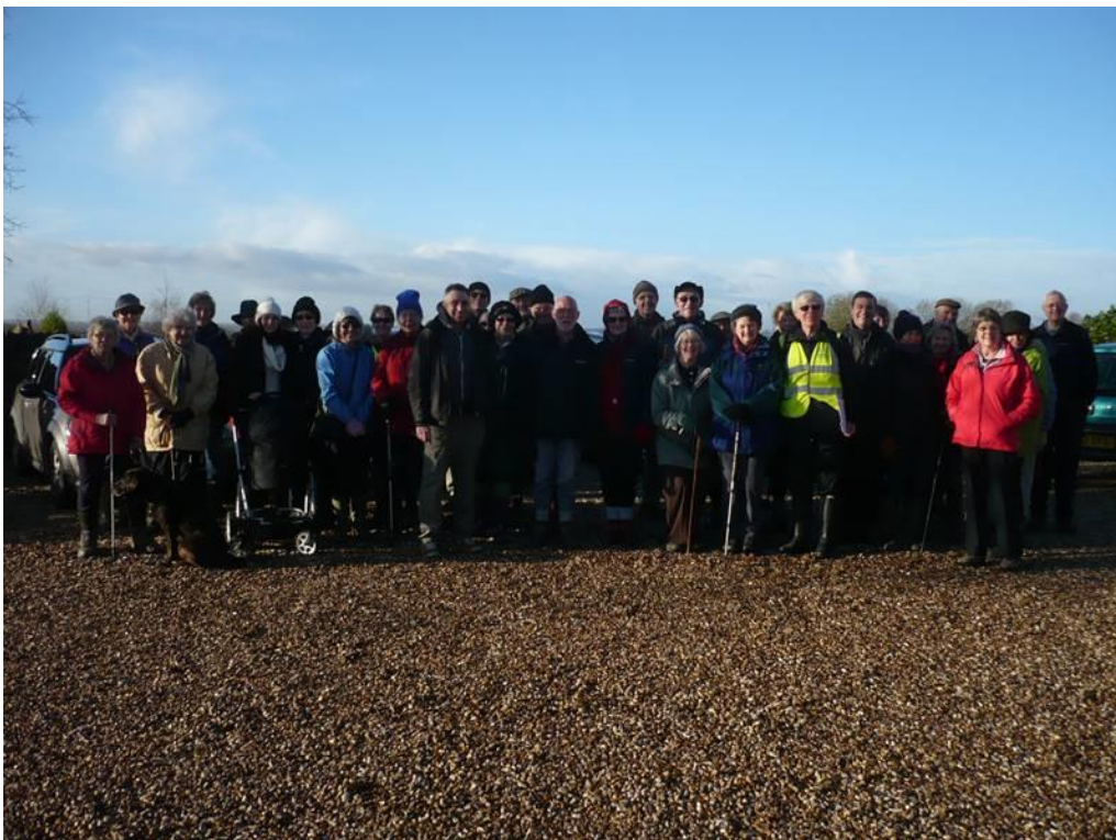
Walkers gathered for the anniversary walk before settling down to a celebration lunch