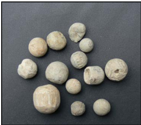
Musket Ball found locally

artefacts, including a soldier's helmet believed to be from the Civil War, have been found around the village.